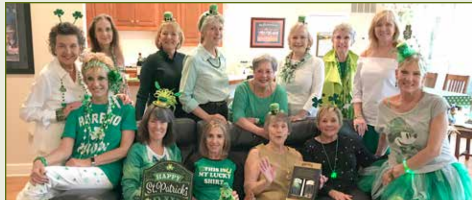
Northlake Senior Team "they know how to celebrate St. Patty's Day!"

As always please feel free to call or stop by the tennis desk for more information. We're happy to help!